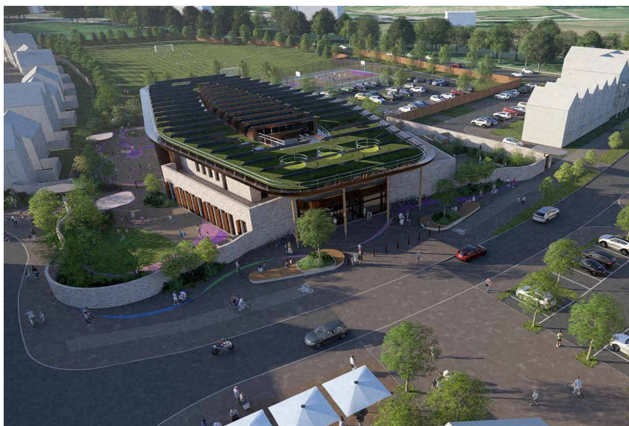
School Building in the Context of the Neighbourhood Centre